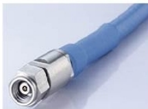
RF Cable Freq.: DC~110GHz