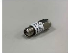
Fixed Attenuator Freq.: DC~40GHz