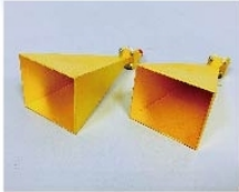
Horn Antenna 67GHz-77GHz