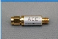
50Ω DC- 6GHz SMA (1dB, 2dB, 3dB, 5dB, 6dB, 10dB, 20dB, 30dB)