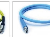
K type 1.0 (M) to 1.0 (M) 100cm Freq.: 110GHz