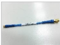
3.5(M) to 3.5 (M) 60 cm Freq.: 26.5GHz