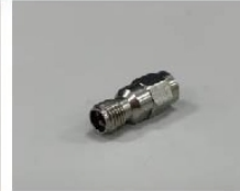
Adaptors Freq.: DC~40 GHz