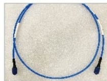
K type 2.92 (M) to 2.92 (M) 60 cm Freq.: 40GHz