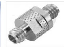
Adaptor Freq.: 0~110GHz