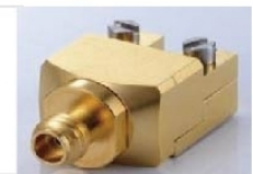
End Launch Freq.: 0~110 GHz