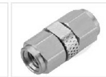
Adaptor Freq.: 0~110GHz