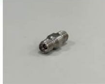
Adaptor Freq.: DC~40GHz