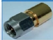
50Ω DC - 18GHz 50Ω DC - 6GHz 75Ω DC - 3GHz