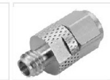
Adaptor Freq.: 0~110GHz