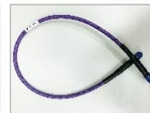
K type 2.4 (M) to 2.4 (M) 60 cm Freq.: 50GHz