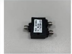
Power Divider Freq.: DC~40 GHz