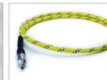
K type 1.85 (M) to 1.85 (M) 60 cm Freq.: 67.5GHz