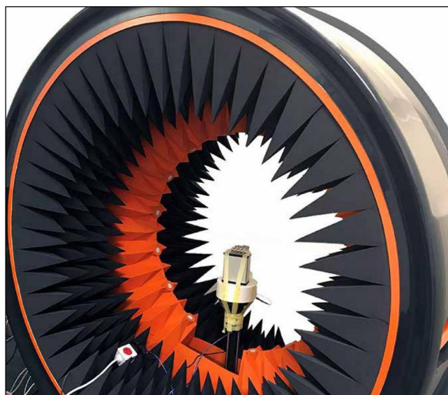
▲ Fig. 1 BBox being tested in StarLab 50 GHz.

Dr. Wane discusses the importance of the technology and why he directed the team towards the StarLab 50 GHz testing solution: "BBox is set to be a highly valued asset for designers, 5G system-level architects and