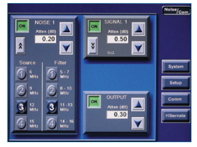
Custom filter control menu