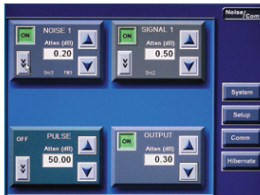
Intuitive standard control menu