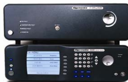
GT-1000A 20 GHz Microwave Power Amplifier and 2520B Microwave Signal Generator

Close proximity to the DUT (or antenna) may also reduce the magnitude of ripple and standing waves in the cabling if the impedance match to the DUT or antenna is not good. Both the effects of cable loss and mismatch reflections become more problematic as the frequencies increase. These effects may be minimized by moving the long cable to between signal generator and amplifier (where the match is